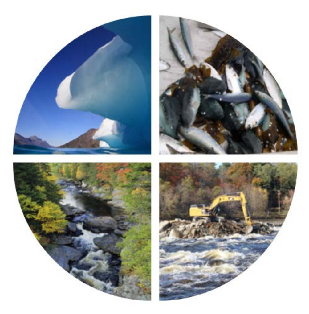
January 8-9, 2014 Orono, Maine USA University of Maine, Nutting Hall